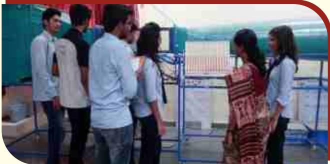
Fluid Mechanics Lab

Civil Engineering programme is started from the academic year 2012-13 with 60 intake capacity. The Objective of the programme is to provide the best Civil Engineering learning experience with a technical competence and managerial ability for nation building, we have experienced and dedicated faculty, who put their dedicated efforts to produce quality Civil Engineers for Tomorrows' World.