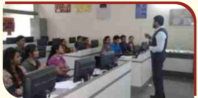
Software Engineering & Database Lab