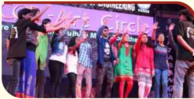
SWARTARANG - 2017

PCCoE organizes its Annual Function 'Swartarang' every year. This annual gathering contains various events such as Antakshari, Elocution, Rangoli, Debate, Fun Fair, etc. along with Cultural Programs for students and staff.