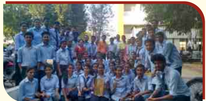
Antenna Design workshop