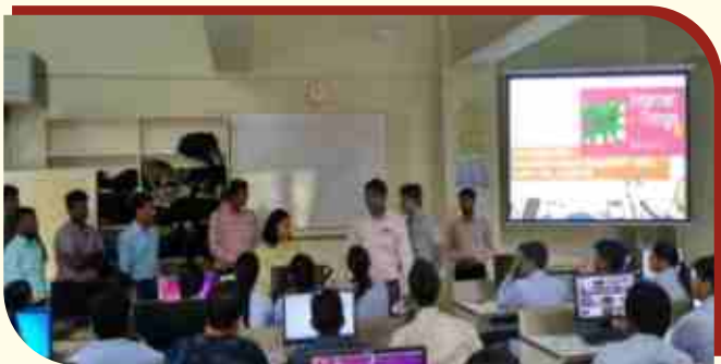
System Software Lab

M.E. IT programme has started in the year 2014-2015. Although in its early age, M.E. IT course has given very good recognition to the whole department by giving the excellent results in the Examinations.