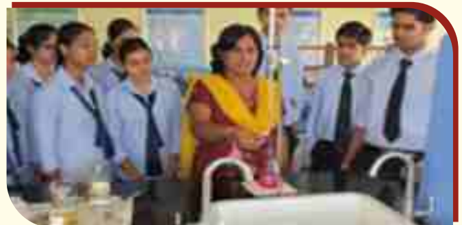
Engineering Chemistry Lab