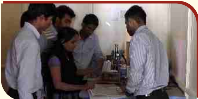
Engineering Physics Lab

First Year Engineering Department initiated various activity clubs in the department. Different activities and competitions are organized under all the clubs, throughout the semester to enhance creativity and develop confidence among students. These events are directed towards overall development of the students.