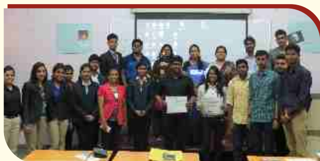
"Cash to Less Cash India" Presentation Competition