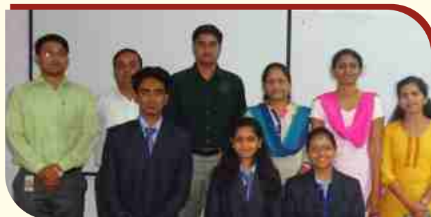
MCA Students Association (MCASA)