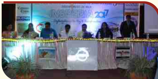
SPECTRUM - 2017

INSPERIA is a State Level Mega Techno-Management Event for MCA students. It is a symposium for Under Graduate and Post Graduate students which lead to develop their Technical and Management Skills. MCA department is successfully organizing this State Level Techno-Management Event from last 4 years.