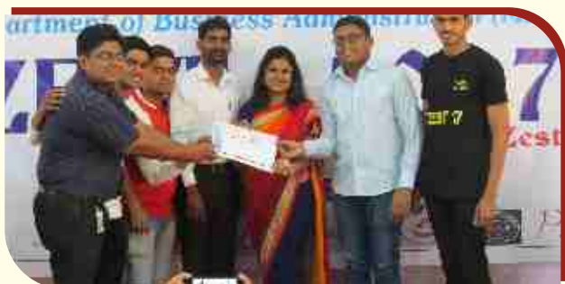
Mega Management Event ZEST

Marketing, HR, Finance, Information Technology Management, Operations Management, International Business Management, Supply Chain Management, Family Business Management & Technology Management