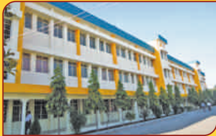
Pimpri Chinchwad Polytechnic (www.pcpolytechnic.com) DTE Code - 6413 Diploma (Mech /EnTc/ Comp /IT/ Automobile/Civil) Contacts: 020-2765 8797