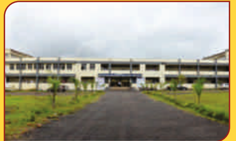
Nutan Maharashtra Vidya Polytechnic (www.nmvpolytechnic.com) DTE Code - 6310 BE (Mech/EnTc/ Comp/ IT) ME (Comp/EnTc) Contacts: 02114-231666 / 777 9503264965 / 9270252277