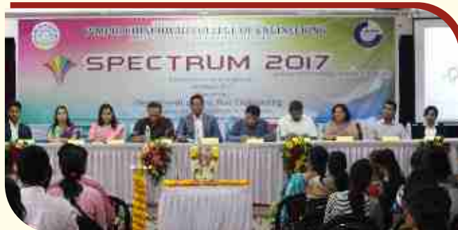
SPECTRUM - 2017

PCCoE organizes SPECTRUM State Level Technical Competition since last 10 years and it has been a Major State Level Event for First Year Students. The thing that makes SPECTRUM really special is the fact that the entire event is managed, created and participated in by First Year Students.