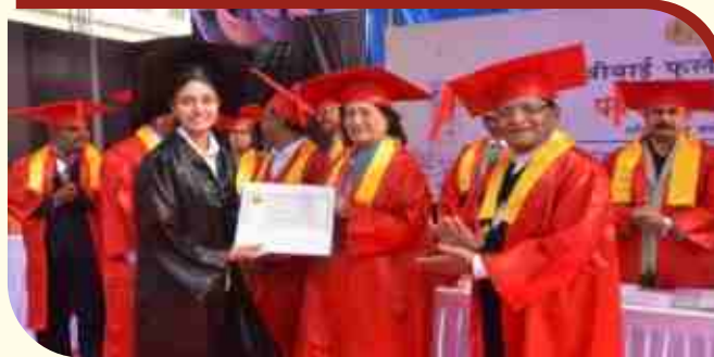
SECOND GRADUATION CEREMONY - 2017