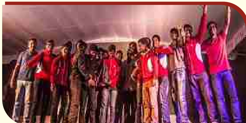
Enduro Students India (ESI) competition 2017