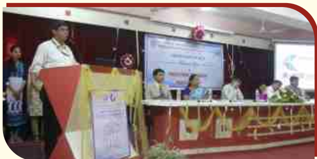
MCA Induction Program

The knowledge and skills required planning; designing and building Complex Application Software Systems are highly valued in all industry sectors including business, health, education and the arts. The Master of Computer Application (MCA) department seeks to combine excellence in IT education and research with service to the industry. We realize that education is fundamental for the complete development of individuals. As a part of premier teaching institute, we endeavour to harness this inherent potential through meeting the growing needs of higher technical education. As we grow, we will expand into new technologies, methodologies, disciplines, resources & even attitudes. The MCA Department was established in July 2007 and has been functioning successfully with annual intake of 60 students and we are providing sound education which synergies theoretical knowledge and practical skills to promote all round professional competence. Apart from syllabus coverage the students are given ample opportunities through MCA Student Association (MCASA) to take part in seminars, workshop and conferences for developing their interactive learning skills.