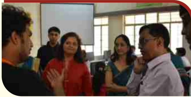
INSPERIA - 2017

PCCoE has been organizing National Level Symposium Techlligent since last 8 years. Various Technical and Co-curricular activities are organized and conducted with great enthusiasm amongst faculty and students.