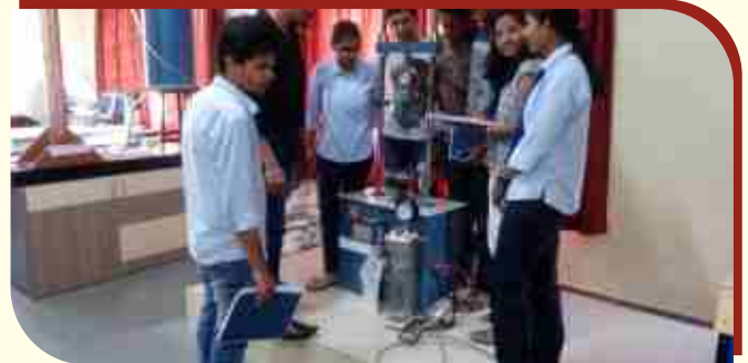
Geotechnical Engineering Lab