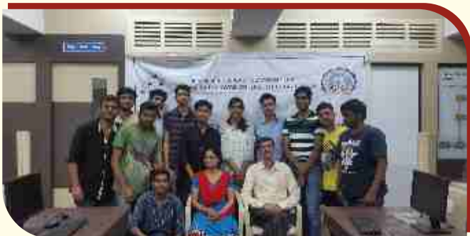
Raspberry pi Workshop

Advances in VLSI have today enabled most systems to become compact, highly reliable and deliver data at high speed. The technological advances facilitate the designer to tailor the IC for specific applications. These increasing capabilities of IC over the years have opened up new frontiers for VLSI industry to grow and provided tremendous scope and growth opportunities for those who aspire to choose VLSI and Embedded systems as a career. Thus the department started M.E in VLSI and Embedded Systems in 2012 with intake of 18. This course aims at preparing students to develop knowledge and skills in VLSI design methodology with a systems perspective in order to facilitate the use of computer-aided design tools for the analysis and design of special-purpose digital and analog circuits and systems. The well-equipped laboratories not only cover the complete syllabus but also motivate students to learn beyond the syllabus thus nurturing the research culture in department.