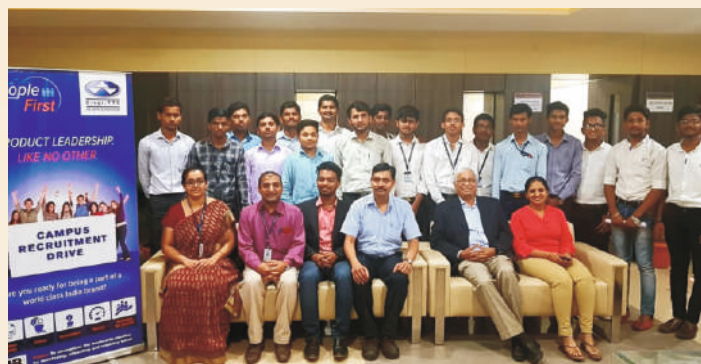
Students placed in Divgi TTS - 2018 Graduating Batch