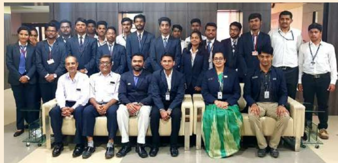
Students placed in Bharat Forge-2019 Graduating Batch