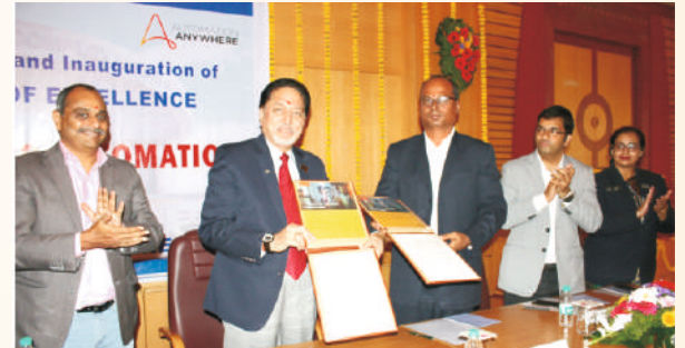
MOU set up in robotics process automation with VIRTUSA