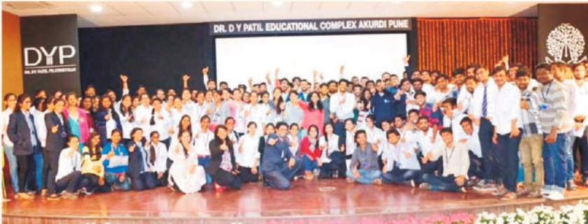
Employability Enhancement Workshop by ASK Corporate Trainings for Final Year Engineering Students