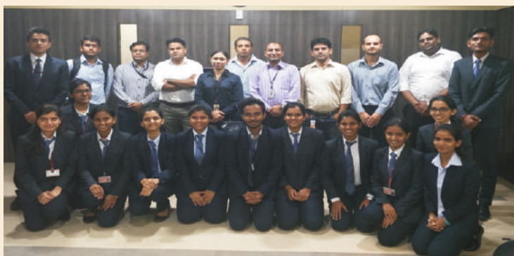
Students placed in Fiserv- 2019 Graduating Batch