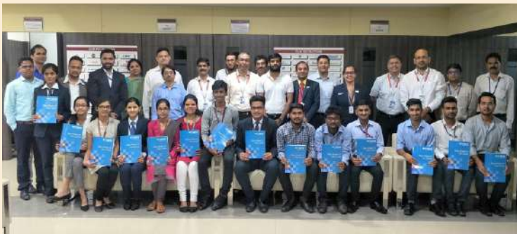
Students placed in NTT Data – 2019 Graduating Batch