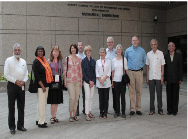
Visit of Cummins Inc,USA Executives and their spouses to Cummins College