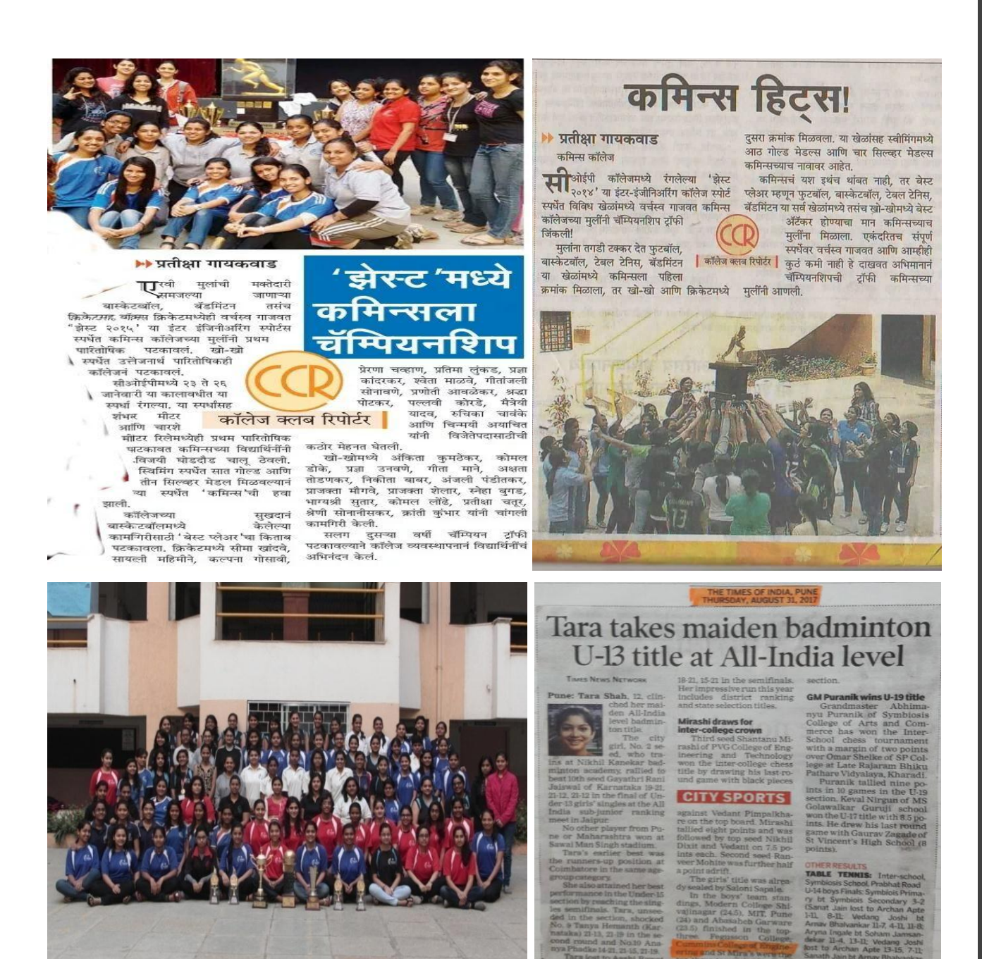
Sports Championship and News Information