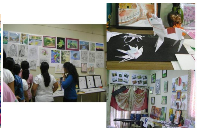
Art and Craft Exhibition