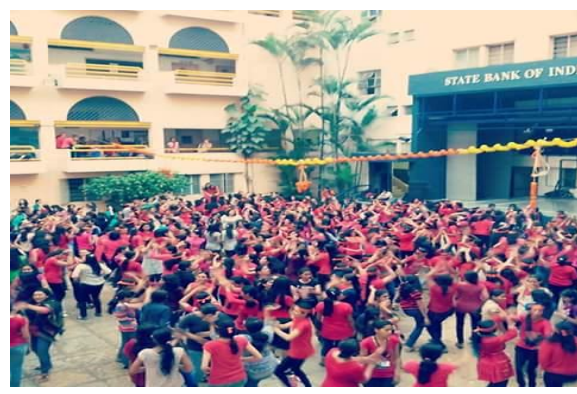
Dahi-Handi festival of Cummins College